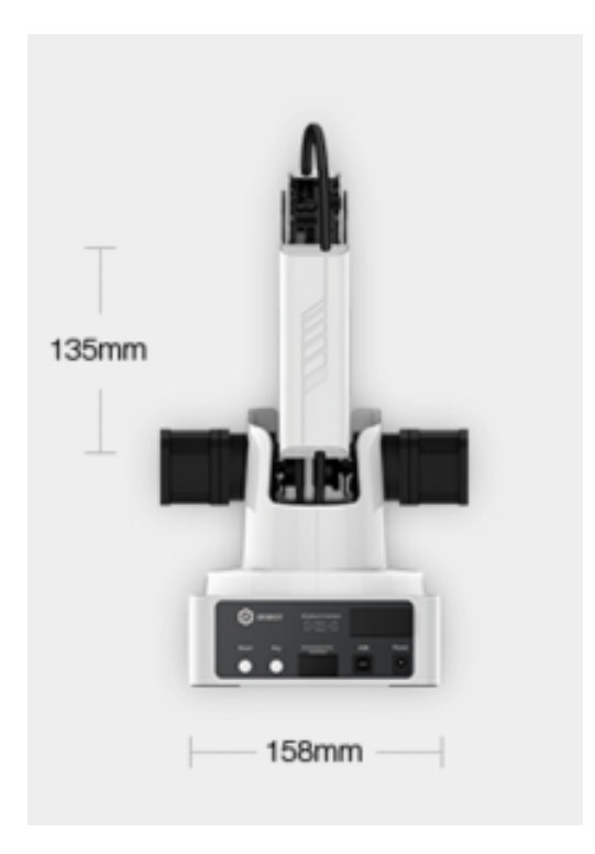
Figure 1. Dobot Magician Arm

Dobot magician has 13 extension ports, 1 programmable key and 2MB offline command storage. One of dobots main characters is its various endeffectors, such as 3D Printer Kit, pen holder, vacuum suction cap, gripper and laser.The