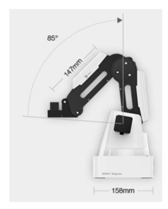
Figure 3. Dobot Magician Arm

file format. It mainly consists of tags like links , joint and material. Many of the coolest and most useful capabilities of ROS and its community involve things like collision checking and dynamic path planning. Its frequently useful to have a code-independent, human-readable way to describe the geometry of robots and their cells. Think of it like a textual CAD description: part-one is 1 meter left of part-two and has the following triangle-mesh for display purposes. The Unified Robot Description Format (URDF) is the most popular of these formats today. This module will walk you through creating a simple robot cell that well expand upon and use for practical purposes later.